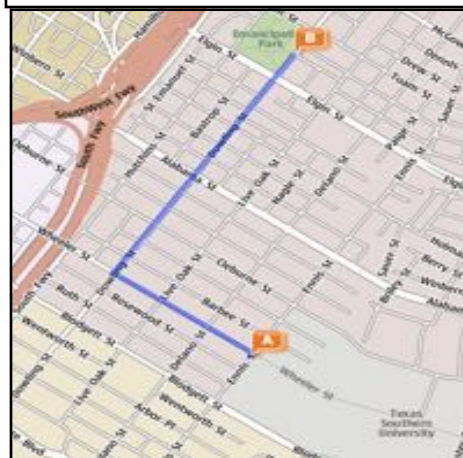
DESIGN DONATED BY WISEMANCOMPANY.COM